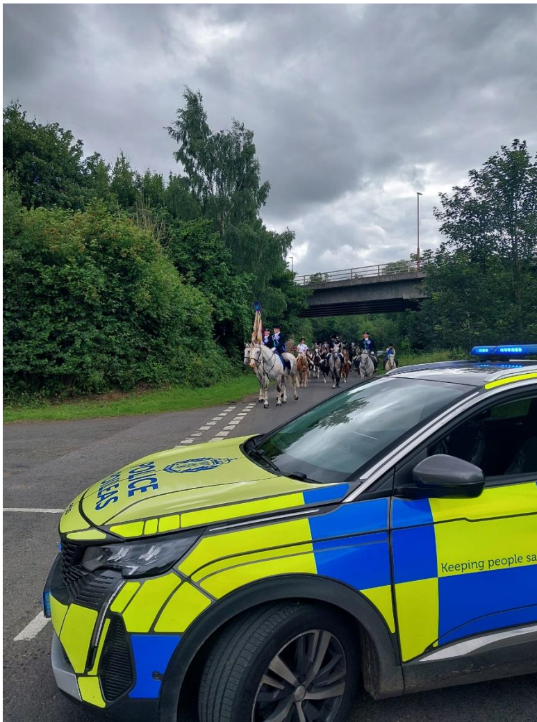
Cavalcade leaving the town for Sprouston this year

Kelso Civic week went well with a great effort from the foot marshals in particular. Police will continue to attend and support common ridings in the coming years, however the number of officers we are able to allocate to events has decreased. Kelso has a huge amount of volunteer foot marshals which helps ensure the safety and sustainability of these events without a heavy reliance on police. Kelso is often given as an example to other towns as to how effective foot marshals are – well done to all those involved.