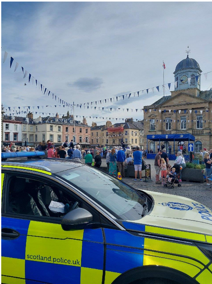
Kelso Square during the Sprouston Ride out

Kelso Civic Week went very well, with a number of very well organised community events and a great atmosphere in the town throughout. Officers always enjoy working these events which gives a great opportunity to engage with members of the community. Special mention to the hard work and organisation of the marshals, both mounted and on foot. There were a impressive amount of foot marshals willing to assist which meant that should officers have been called away, contingency plans to allow the event to continue were robust.